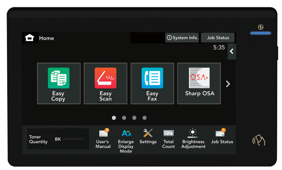
10.1" (diagonally measured) customizable touchscreen display.