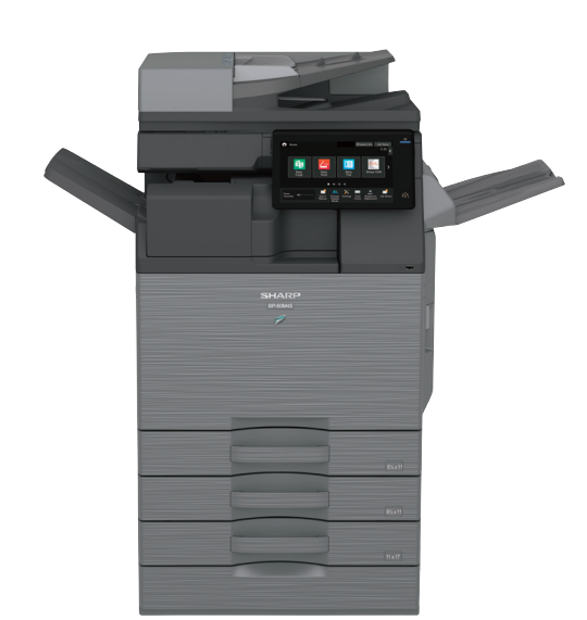
BP-50M45 shown with Inner Folding Unit, Right Side Exit Tray, and 2-drawer Paper Deck.