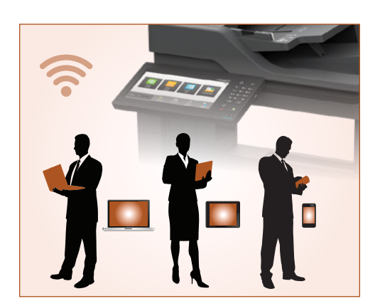
Optional wireless network interface for convenient scanning and printing from mobile devices.