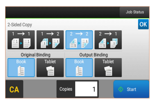
Easily copy documents in 1-sided or 2-sided formats.