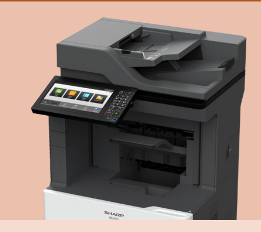
MX-B557F shown with optional inner finisher