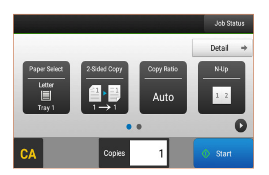
Easy Copy screen offers the most commonly used settings.